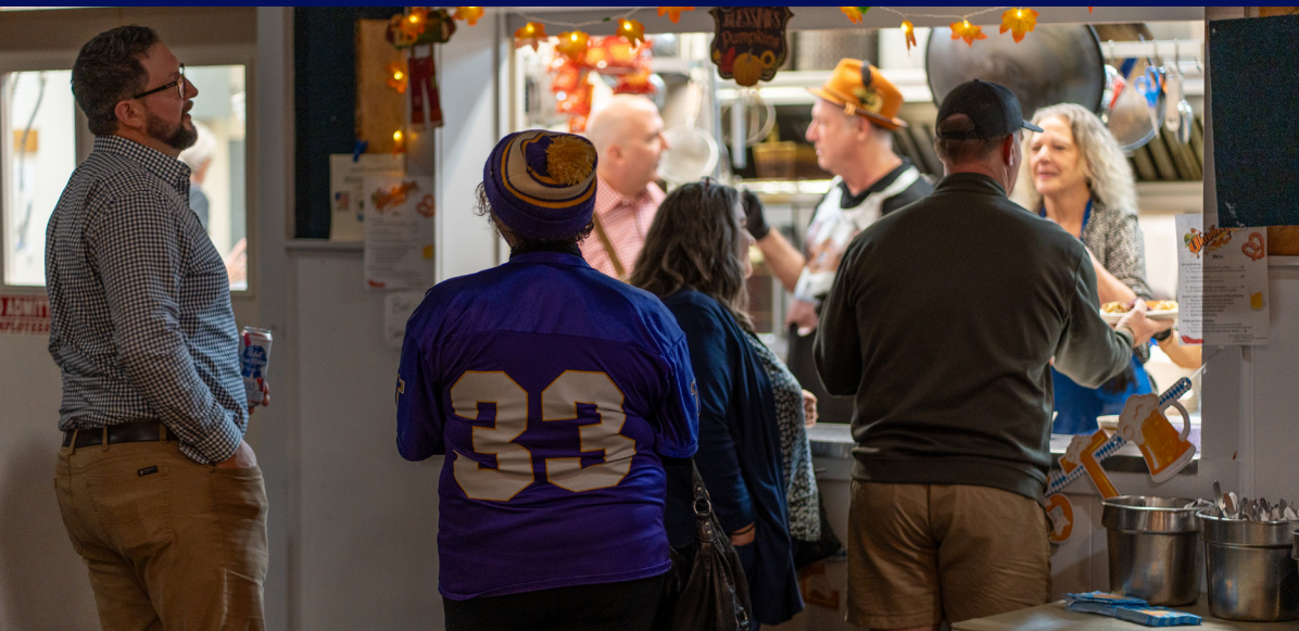
Serving up dinners at Oktoberfest

4426 California Ave SW Seattle, WA 98116 (206) 938-4426